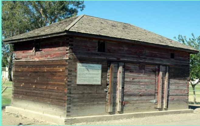
Firebaugh Historical Jail

Completed around 1885, this jail is one of only two Lincoln-log style jails still in existence in California. This unique type of construction has no frame and uses square nails and wood plank floors. The jail has two cells inside. In its day, it housed “banditos” along with Firebaugh’s more disorderly citizens. It also housed a fierce, gun toting woman who lived in the building with her goats. On one occasion, a prisoner broke free after friends hitched a team of horses to the window bars and yanked them out. The partially restored jail had been placed at various locations throughout Firebaugh before being moved to its final resting place at the Firebaugh Rodeo Grounds, which is east of its original site on the northwest corner of P and 13th Street.