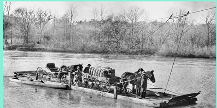
19 th century ferries – rope style